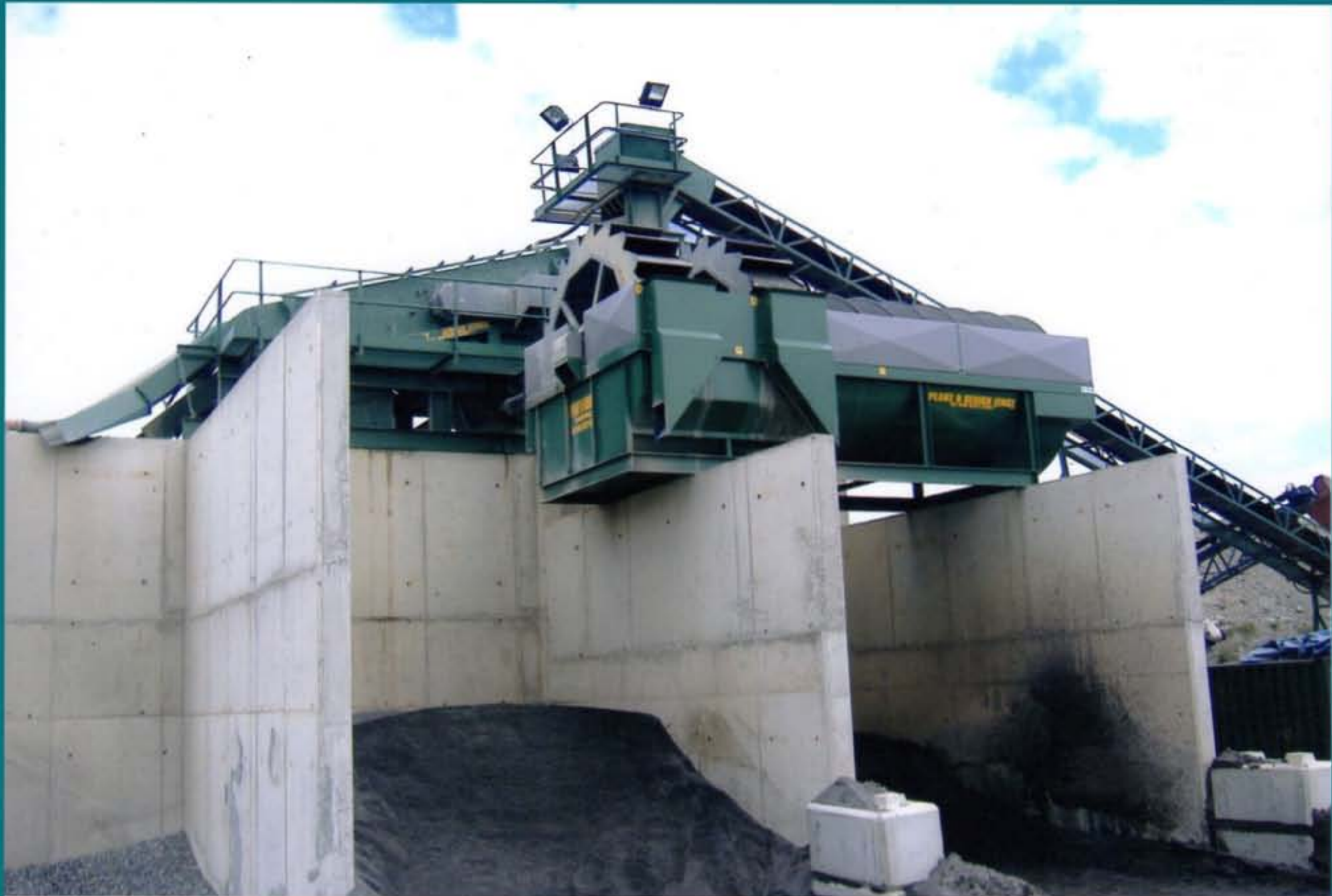
Image: 20 x 5 (6m x 1.5m) Washing Screen, with 100 TPH Twin Wheel Dewaterer

Plant & Design Engineering offer competitive prices and a personalised service. With your material analysis, capacity, end products required etc, we design and build what you want. A tailor-made machine for a new or existing application. Washing and Screening engineering simplified.